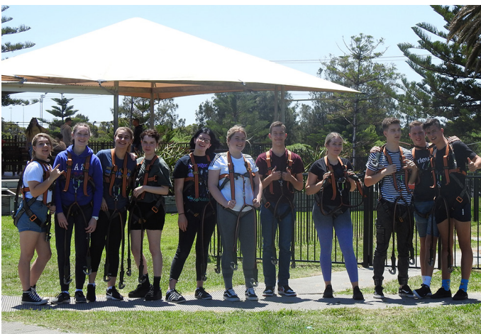
Year 12 Camp adventures.