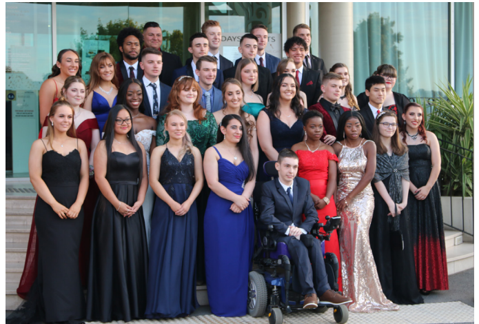
The Year 12 students of 2019.